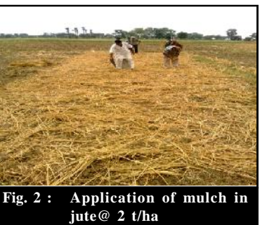
20110-11, demonstration on sulphur application along with recommended dose of fertilizer and mulching was laid out (Fig. 1 and 2). Maximum jute fibre was obtained from application of sulphur over recommended dose

were demonstrated (application of sulphur @30kg/ha along with recommended dose of fertilizer, mulching@ 2 ton/ha and augmented nutrition i.e. NPK 80:40:40) in order to deal with drought like situation.In fisrt year